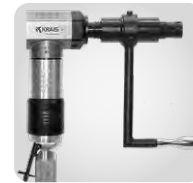
Crank arm with double feed stroke