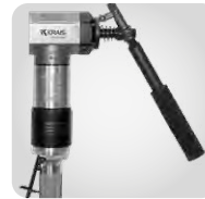
Lever feed handle