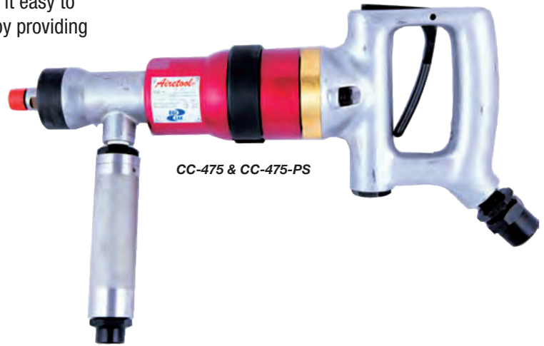
CC-475 & CC-475-PS

Airetool lightweight condenser & geared drive cleaners make it easy to maintain your industrial process at a high level of efficiency by providing cleaning motors that are both powerful and durable.