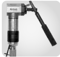
Lever feed handle