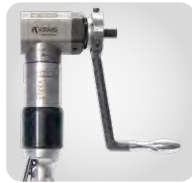
Crank arm single feed stroke