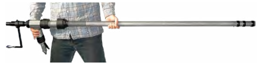
On demand we offer 3WTTTC with reach up to 5 m.