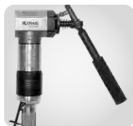
Lever feed handle