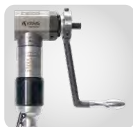
Crank arm single feed stroke